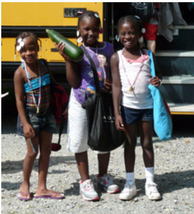
Newsletter layout and design by Ruth Dubb

We continue to conduct a six week program of environmental education and swimming. As in